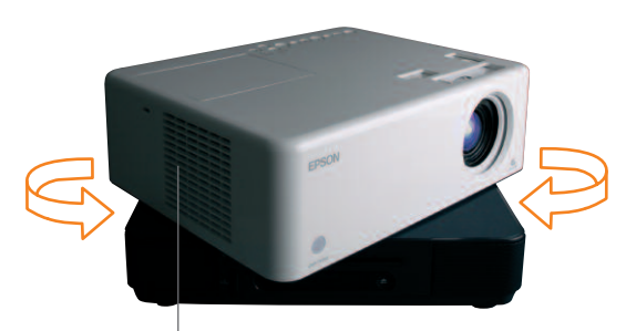
Includes free 80" wide screen for entertainment anywhere!

HD Ready projector, DVD, and speakers bring surround sound action into any room - simply plug in and play!