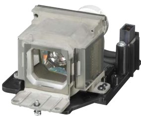
LMP-E212 Projector Lamp (for replacement)