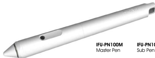
IFU-PN100M Master Pen